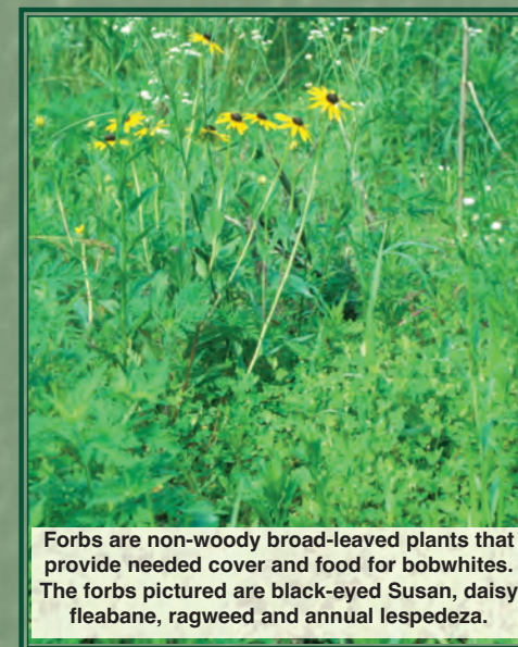
Forbs are non-woody broad-leaved plants that provide needed cover and food for bobwhites. The forbs pictured are black-eyed Susan, daisy fleabane, ragweed and annual lespedeza.

Illustration reprinted with permission of the Virginia Department of Game and Inland Fisheries